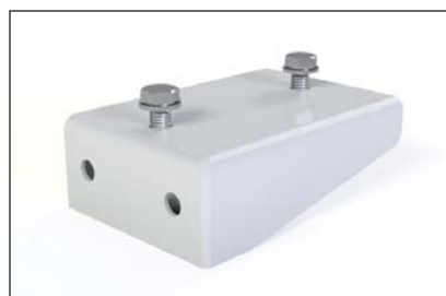
Lower Mounting Bracket