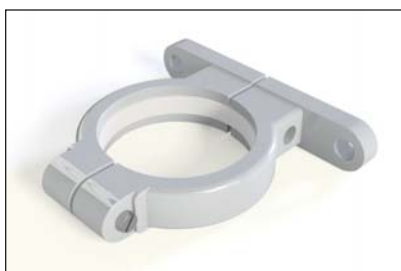
Upper Mounting Bracket