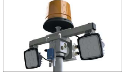
Model 2 x 30 Watt LED* (52611-B)