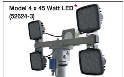
Model 4 x 45 Watt LED* (52624-3)