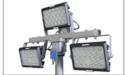
Model 3 x 50 Watt LED (52617-3)