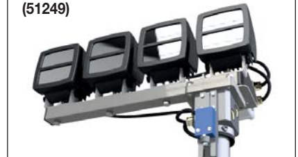
Model 4 x 50 Watt LED One-sided (51249)