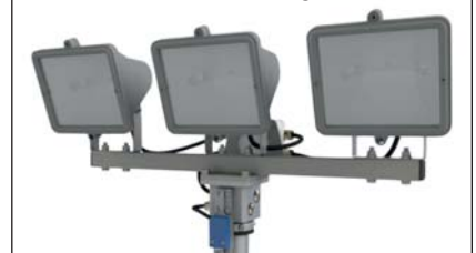
Model 3 x 500 Watt Halogen* (26350)