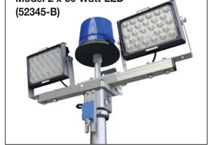
Model 2 x 50 Watt LED* (52345-B)