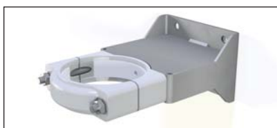
Upper Mounting Bracket