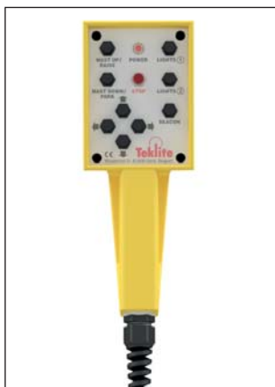
Cable Remote Control-YH