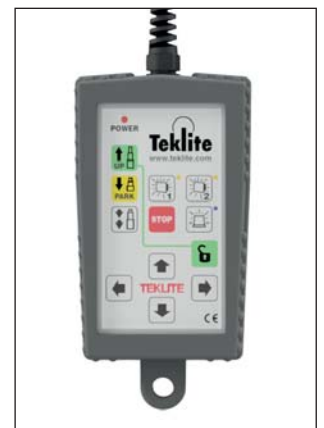
(Optional) RF Remote Control Kit