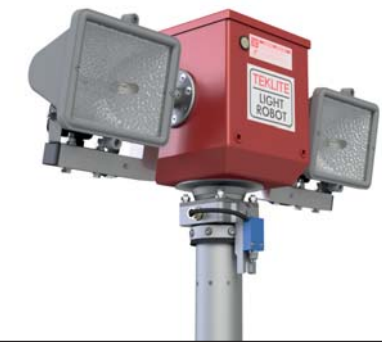
Model 2 x 500 Watt Halogen* (25279)