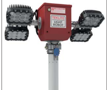
Model 4 x 100 Watt LED (52672)