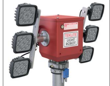
Model 6 x 45 Watt LED (52706)