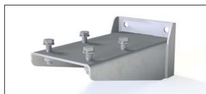
Lower Mounting Bracket